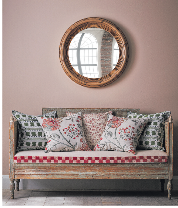
James Hare Ready Made Cushion Collection from RNI