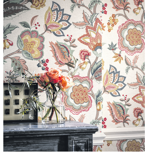
Andrew Martin's dramatic shade of apricot wallpaper creates an alluring, impressive and inviting space available from RNI

contemporary and easy entrance space, a perfect backdrop for art and wall hangings.