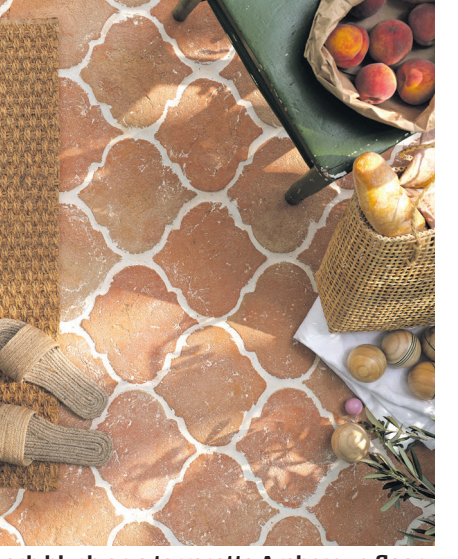
Peach blush on a terracotta Arabesque floor from Tilestyle

Of course, there is an endless selection of shades of peach or apricot paints available on the market. My advice is to apply soft and gentle matt finish hues to the walls of a hallway, stairs and landing to create a calm,